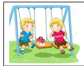
third - go