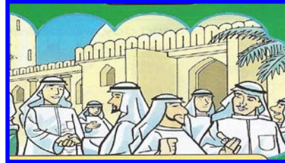
pray - mosque