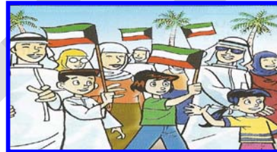
march - street