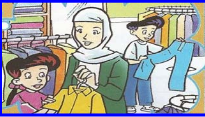
buy - new - clothes