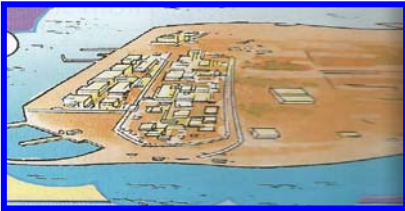
go - Failaka