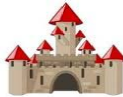
see_ the fort