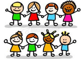
feel _so happy