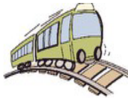
take _ train