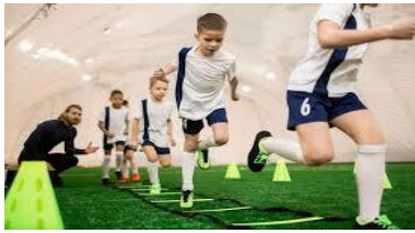
( go - club )

Write three sentences about ( Keep fit )