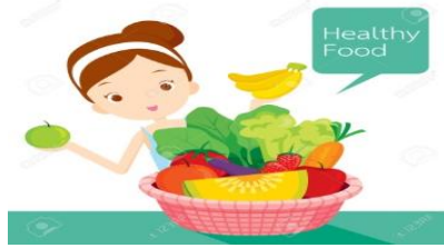
( eat - healthy )