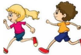
( run - fit )